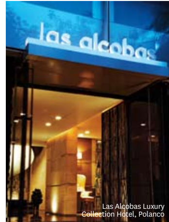
Las Alcobas Luxury Collection Hotel, Polanco

IN POSH POLANCO , Mexico City's elite collect in world class restaurants after a workday spent negotiating business deals or a Saturday spent shopping at the city's upscale mall, PALACIO DE LAS HIERRAS . (There's a heliport on Palacio's rooftop and one of the city's oldest restaurants, PRENDES , on its ground floor.)