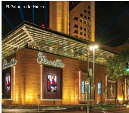
El Palacio de Hierro