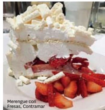
Merengue con Fresas, Contramar

LA CONDESA , a vibrant enclave marked by colorful homes and tree-lined streets— AVENIDA AMSTERDAM the most notable among them—buzzes with activity, in restaurants and cafes during the day and clubs and bars at night. CONTRAMAR , famous for its rapid-fire service and celebration of the Mexican sobremesa tradition—it officially closes at 6 p.m., but patrons often remain seated until well past midnight—is one of the neighborhood's best-loved eateries.