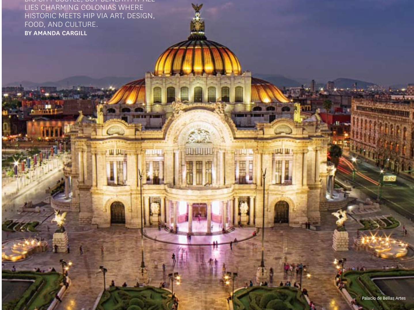
Palacio de Bellas Artes

MEXICO CITY IS EN FUEGO. On the travel trend scale, wherein one equals “Don’t bother” and ten equals “Get there before the college kids come,” Mexico City is currently an 11.